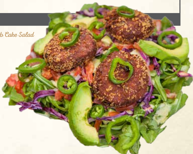
Crab Cake Salad

Arugula, red cabbage, cheddar, avocado salsa and buttermilk fried chicken breast topped with crispy tortilla strips and cilantro cream