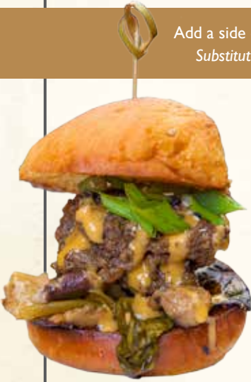
The Dirty Ninja Slider

Add a side of our house made pickled vegetables for $1 Substitute vegetarian black bean for no extra charge!