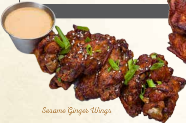
Sesame Ginger Wings