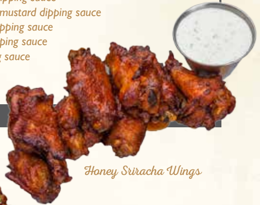
Honey Sriracha Wings