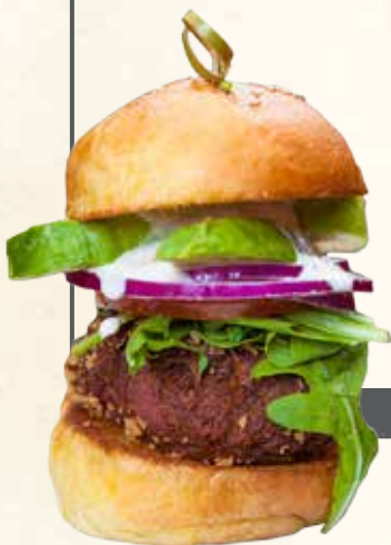
Crab Cake Slider