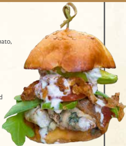
Bacon Blue Slider

Topped with prosciutto, provolone, arugula, fried tomato, red onion, pesto and balsamic reduction