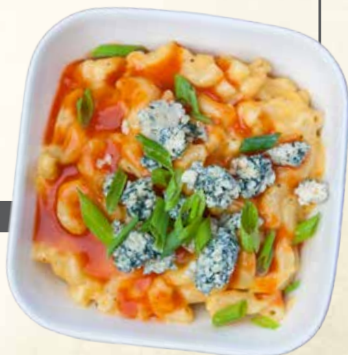
Buffalo Chicken Mac

Grilled corned beef, house made sauerkraut with dirty secret slider sauce