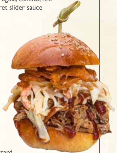
The Dirty Pig Slider

Buttermilk fried chicken topped with cheddar, arugula, pickles and dirty secret slider sauce