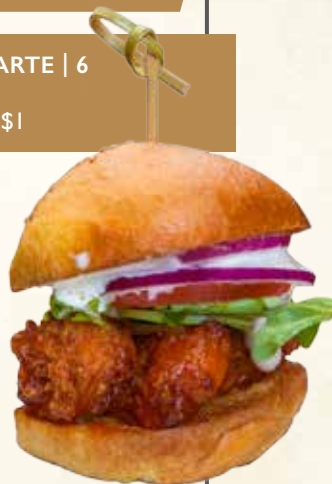
Flyin' Shrimp Slider

Panko crusted crab cake topped with arugula, tomato, red onion, avocado and horseradish cream